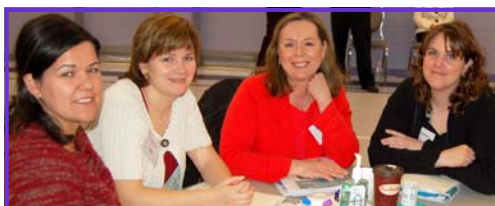
Attendees at the Community Providers Train-the-Trainer session.

CSICN is midway thru hosting Infection Control Train-the-Trainer sessions for our Community Health Care Providers.