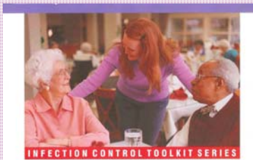
Infection Control for Long-Term Care Facilities

A complete list of the resources can be viewed on our website at http://ricn.on.ca/csicnlibraryc340.php